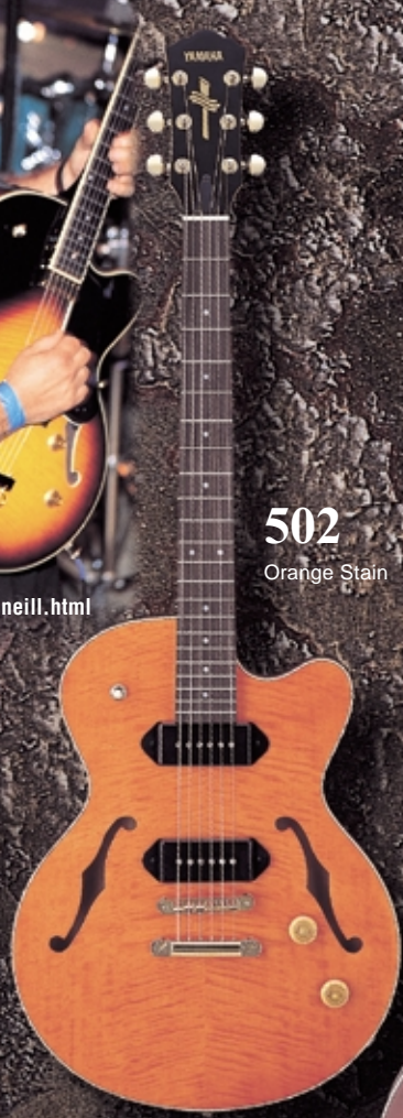
502 Orange Stain