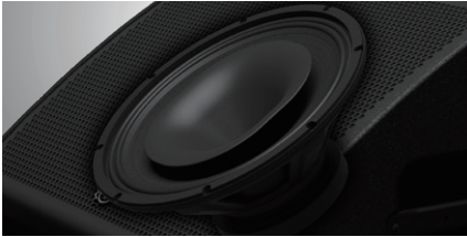
15" coaxial driver

*CHR12M and CHR15M feature a 1.75" coaxial compression driver