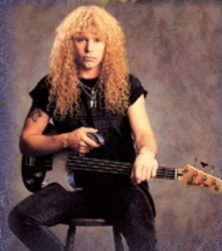
Perry Richardson (Firehouse)