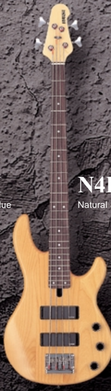
N4III Natural Satin