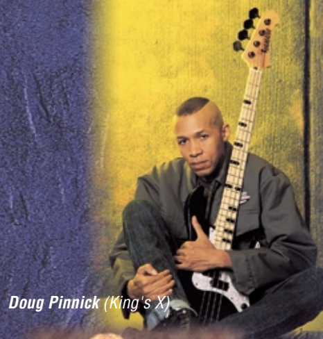
Doug Pinnick (King's X)

In commemoration of the Attitude lines 10th year we have issued a special edition 10th anniversary model. Available in Purple Metallic and Black metallic, the bass features position markers that are of Billy's fingerprints along with a plaque, which carries a unique serial number and Billy's signature.