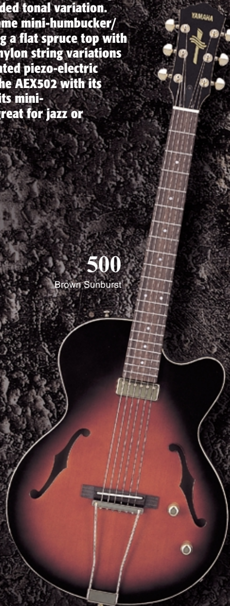
500 Brown Sunburst