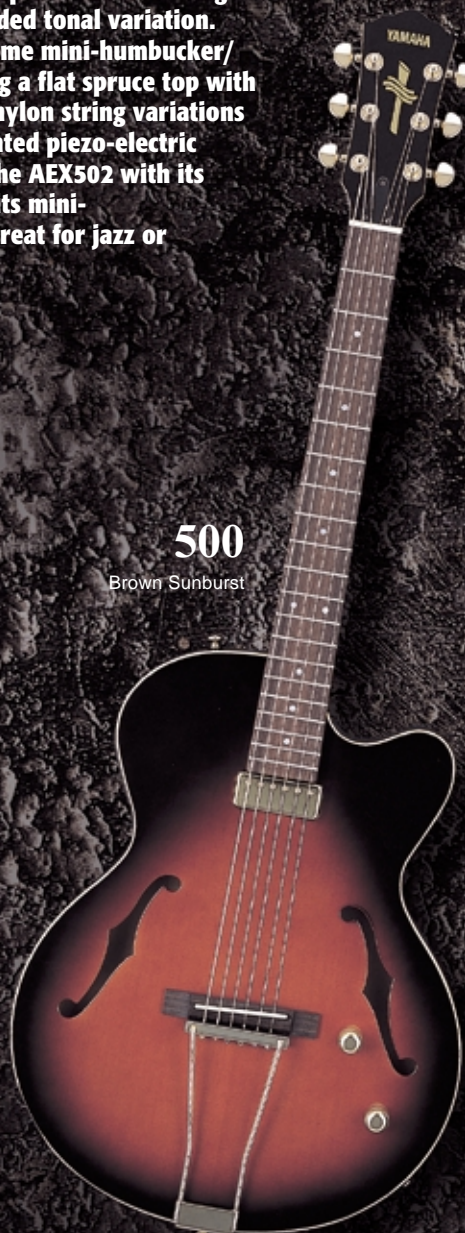
500 Brown Sunburst