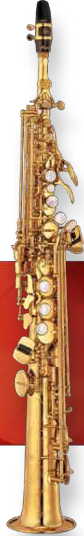
YSS-875EXHG with Straight neck SG2