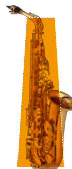
875EX Taper Shape