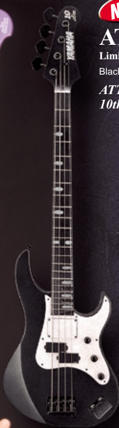
Doug Pinnick (King's X)