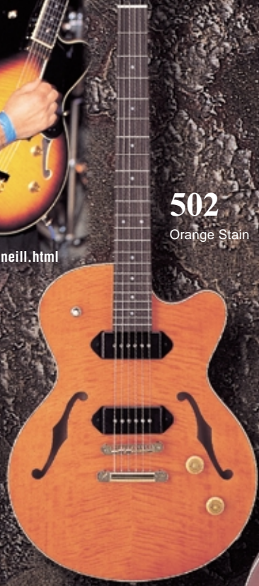
502 Orange Stain